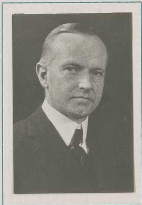
CALVIN COOLIDGE President of the United States